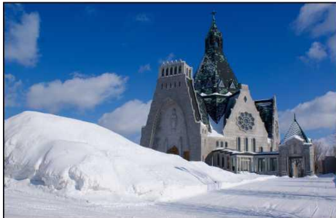
Notre-Dame-du-Cap Basilica in March 2015

The bishops of Québec meet twice yearly in a plenary assembly close to the basilica.