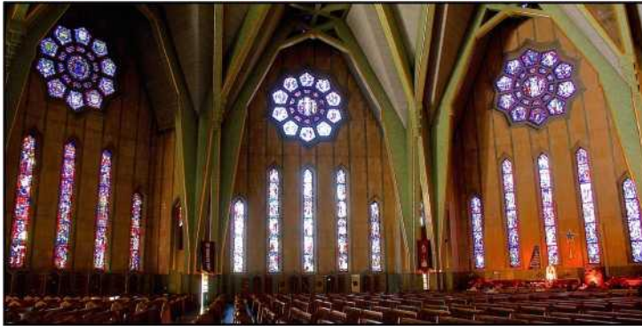
Interior view of the basilica, north side.

From left to right : first, second, and third north transepts.