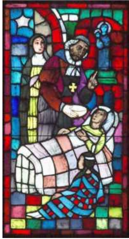
St François de Laval (1623-1708), first bishop of Québec, at the bedside of a sick person Location of the window: second south transept – third lancet – fourth panel