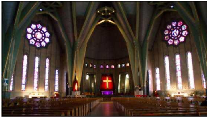
The centre aisle seen from the main entrance.

From left to right : first, second, and third north transepts.