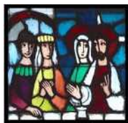
Pages 1.8, 2.6, 3.8, 4.7 et 5.9: Detail from The Wedding at Cana ( John 2: 1-11 ) Location of the window: second north transept - third lancet – third panel