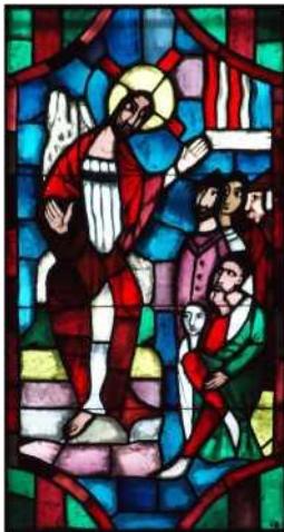
Jesus teaching the crowds Location of window: second north transept – second lancet – fourth panel